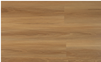
BLACK BUTT GESPC0605