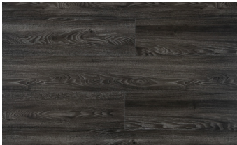
MIDNIGHT OAK GESPC0601