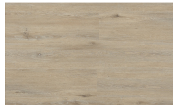
COASTAL LIMED OAK GESPC0615