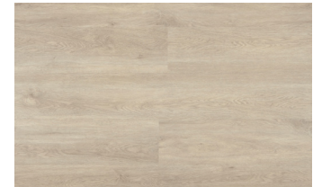
BRUSHED OAK GESPC0608