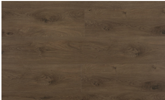
AGED OAK GESPC0609