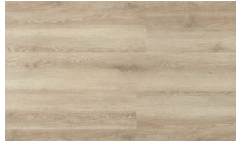
IVORY ASH GESPC0610