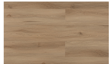
COASTAL SPOTTED GUM GESPC0616