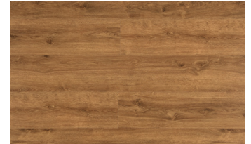
GOLDEN TEAK GESPC0612