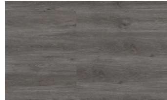
BALTIC GREY GESPC0611