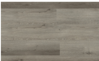
LIMED GREY OAK GESPC0617