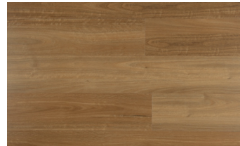
SPOTTED GUM GESPC0606