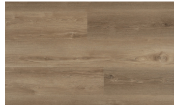
GRAND OAK GESPC0607