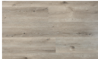
BLEACHED OAK GESPC0602