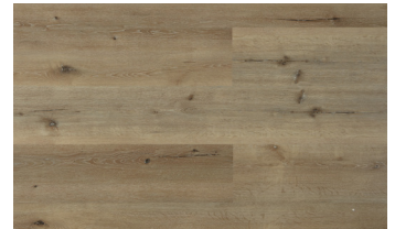
SMOULDER OAK GESPC0604